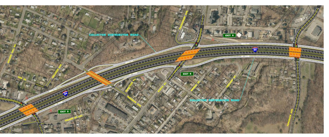
A concept being studied by the Project team.

The I-84 Danbury Project is currently in the Concepts Study phase. During this phase, Project engineers, planners, and community stakeholders evaluate various concepts to improve the I-84 Danbury corridor and recommend a range of reasonable alternatives.