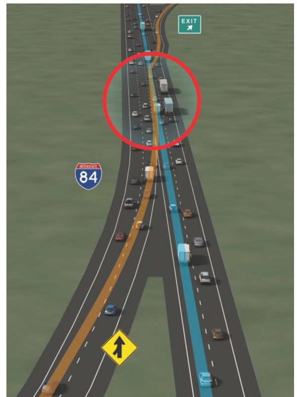
Drivers entering the highway cross paths with drivers exiting the highway.

The ramps contribute to many of the congestion and safety problems in the corridor.